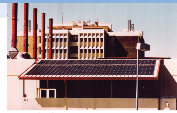
University of California, Irvine CA