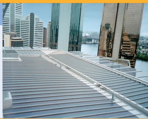
23.8 kW, Brisbane, Australia

The Architectural Roof Solution is ideal for architecturally designed roofing systems. The "peel and apply" laminates are easy to install, lowering installation cost compared to traditional PV systems. The UNI-SOLAR® system solutions provide everything for complete electricity generating solar roofs.